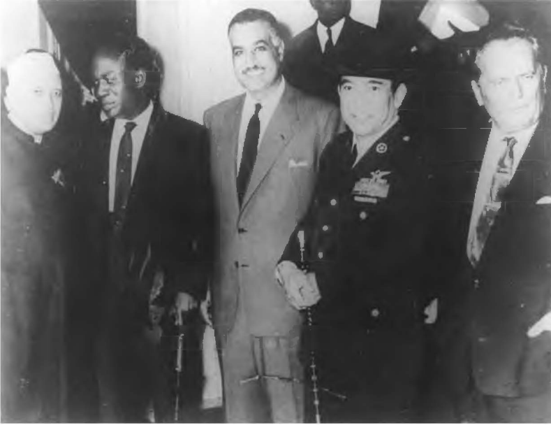
Belgrade, Yugoslavia, September 1961: Standing tall—presidents and prime ministers at the first meeting of the Non-Aligned Movement. From left: Nehru, Nkrumah, Nasser, Sukarno, Tito.

as judges.” The colonizer continues to brutalize the people in Vietnam, Madagascar, West Africa, the West Indies, and elsewhere, but the colonized now have the advantage. “They know their temporary ‘masters’ are lying. Therefore that their masters are weak.” 4