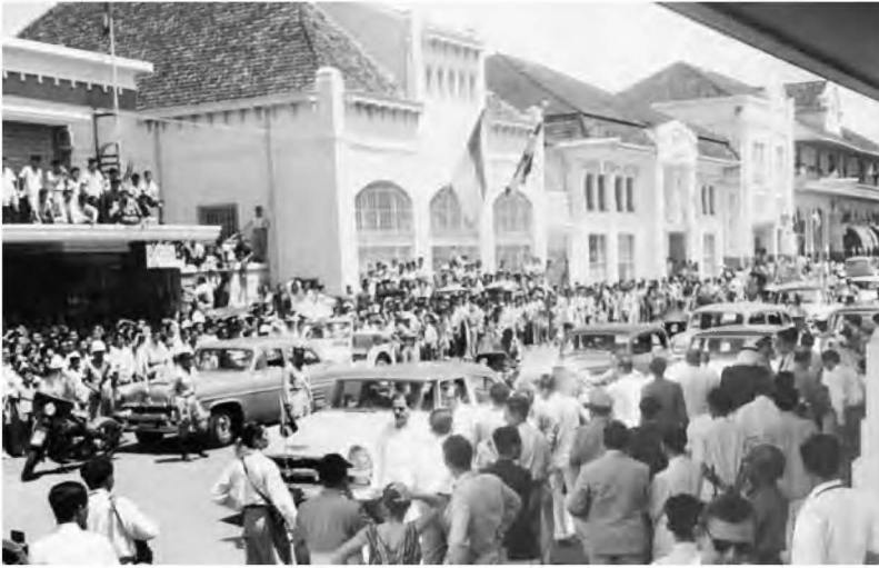
Bandung, Java, Indonesia, April 1955: Bandung's people greet the representatives to the Afro-Asian Conference.