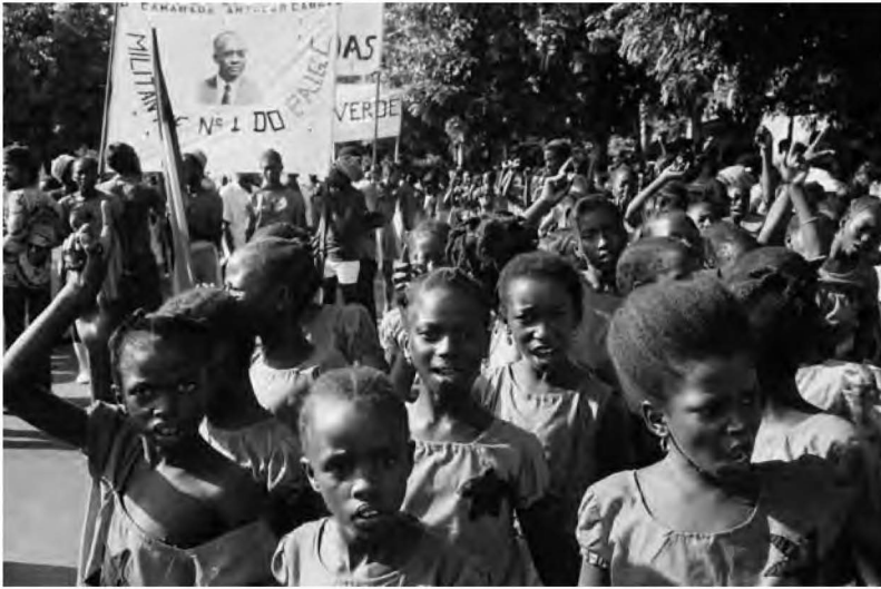
Guinea-Bissau, September 1974: No Fist Is Big Enough to Hide the Sky.

in a battered Soviet Union. Phrases like “massive retaliation” and “brinkmanship” provided no comfort to the two-thirds of the world’s people who had only recently won or were on the threshold of winning their independence from colonial rulers.