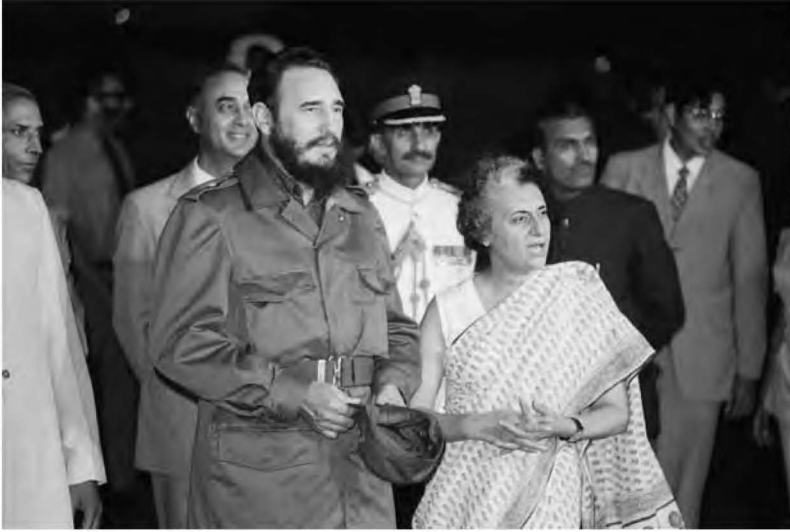
New Delhi, 1983: Indian prime minister Indira Gandhi receives Cuban president Fidel Castro at New Delhi Airport for the Non-Aligned Movement conference.