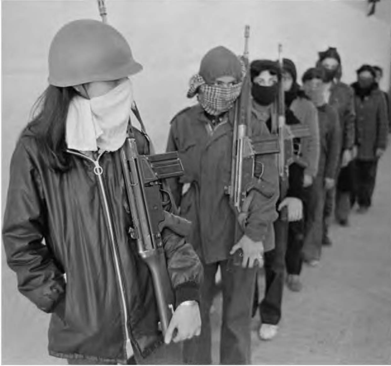
Tehran, Iran, February 1979: The Iranian Revolution—female Fedayin Communist fighters train in the use of armed combat at Tehran University.

and from among the country's intelligentsia. The Tudeh Party (heir to the Communist Party founded in 1920) had a cadre of 25,000, while its union federation boasted a membership of 335,000. 1 The influence of the Tudeh angered the U.S. establishment, which offered the National Front leader a choice: either crush the Communists, take U.S. aid and remain in power, or else fall under Soviet-Communist influence. On May 2, 1953, Mosaddeq revealed the shallowness of his class, whose investment in nationalism and national sovereignty only went as far as it would guarantee its rule and luxury; he wrote a letter to President Dwight D. Eisenhower, in which he cowered, "Please accept, Mr. President, the assurances of my highest consideration." 2 Afraid of the Soviets, Mosaddeq crushed the Tudeh Party, thereby destroying the most organized defenders of Iranian sovereignty, and then fell before a coup engineered by the CIA's representative and a far more reliable U.S. ally, the Shah.