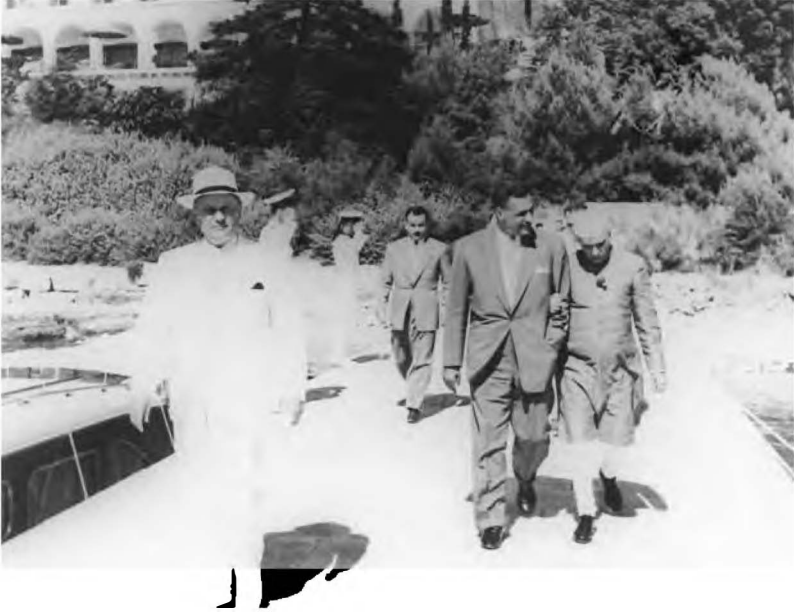
The Brijuni Islands, Yugoslavia, July 1956: The Titans at Brijuni, enfolded by the sounds of Suez.

Third World countries. Dependency was increasing rather than decreasing, poverty was persisting and the income gap between the Rich North and the Poor South was getting wider.” 1 According to the World Bank, “In 1960 per capita GDP in the richest 20 countries was 18 times than in the poorest 20 countries. By 1995 this gap had widened to 37 times.” 2 The divergence between the North and the South grew as the Third World fragmented. But even this spatial metaphor of the North and the South is insufficient; it ignores the mature class hierarchies that had grown within each of the countries in the South and the North.