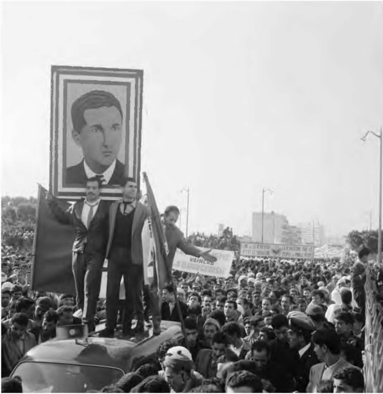
Oran, Algeria, January 1964: The Revolution Is for the People—Algiers takes to the streets to defend President Ahmed Ben Bella.

Armed action has the tendency to reduce ambiguity. There is no space for complex positions, because a war of liberation can have only two sides on a battlefield. Three months after the initial assault, colonial officials across Algeria noted a change in the popular mood and the emergence of a newly confident conversation about independence. 1